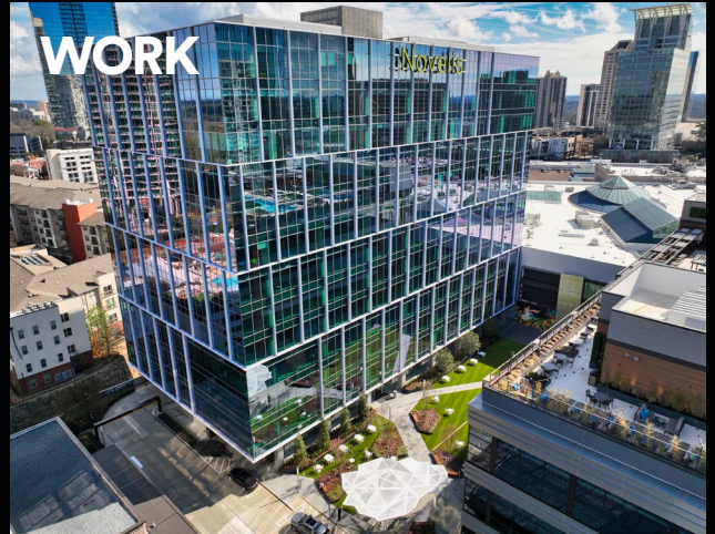
Phipps Plaza, Atlanta, GA