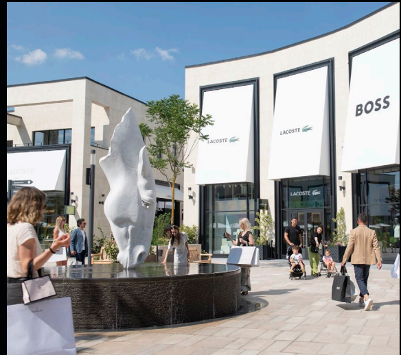
Paris-Giverny Designer Outlet, Vernon, France