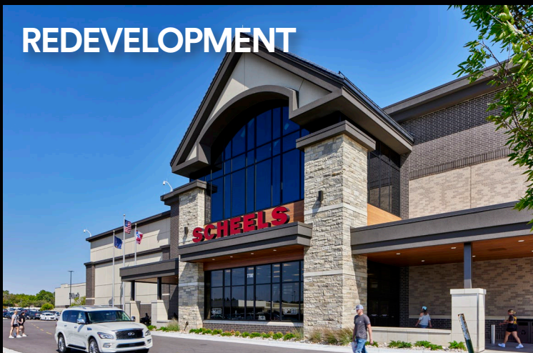
Towne East Square, Wichita, KS