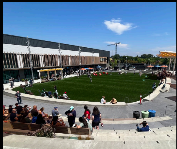
Northgate Station, Seattle, WA