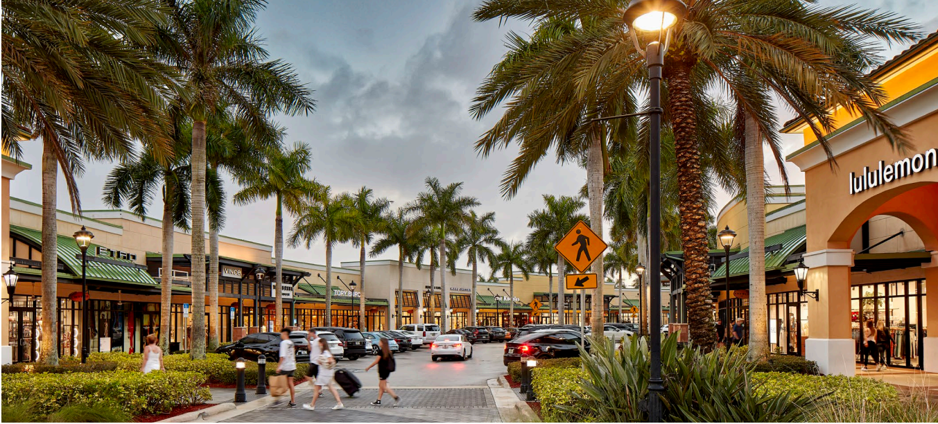
Sawgrass Mills, Sunrise, FL

“Consistent outperformance in cash flow growth, value creation and returns to shareholders, have been, and we expect will continue to be, hallmarks of Simon.”