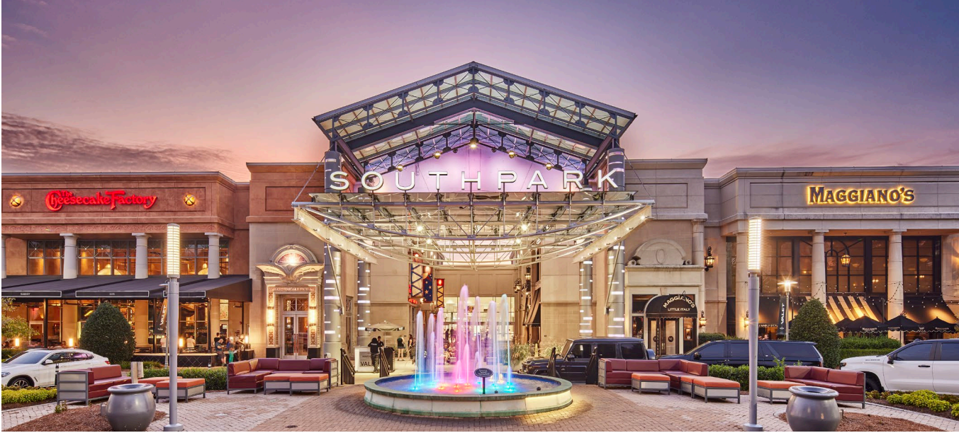
SouthPark, Charlotte, NC