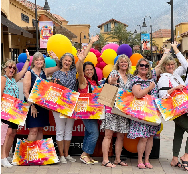
National Outlet Shopping Day