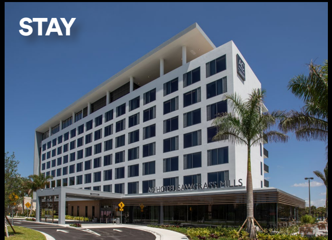
Sawgrass Mills, Sunrise, FL