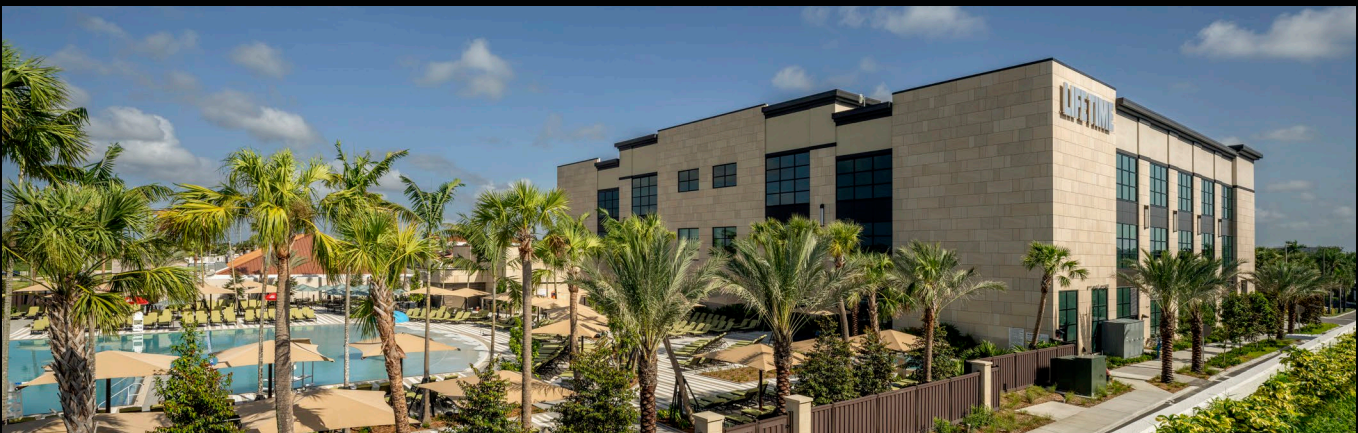
The Falls, Miami, FL