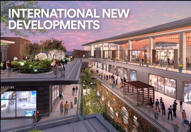
Jakarta Premium Outlets, Jakarta, Indonesia