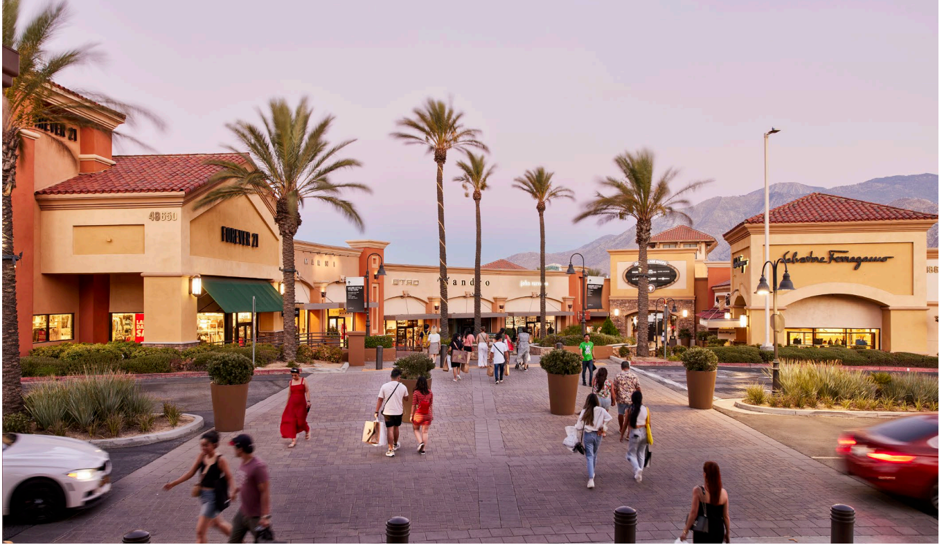
Desert Hills Premium Outlets, Cabazon, CA