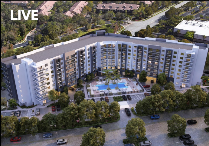
Coral Square, Coral Springs, FL