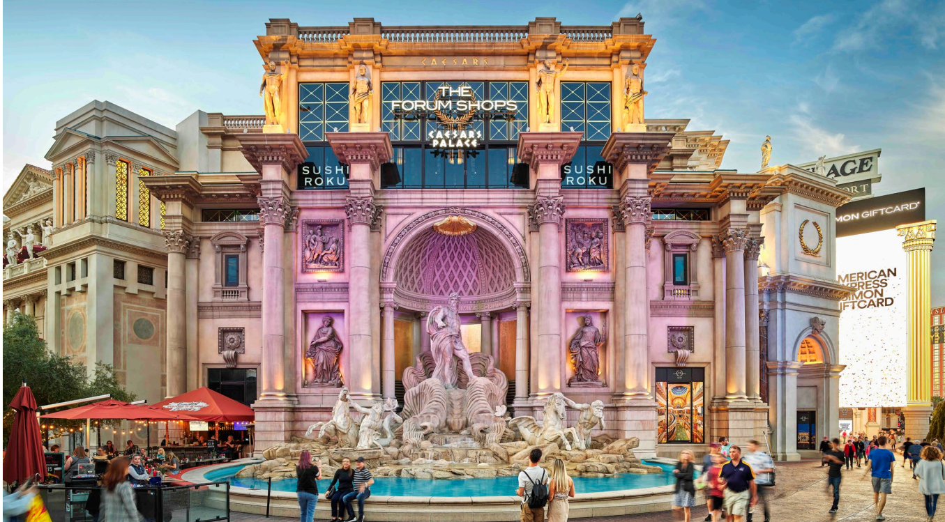
The Forum Shops at Caesars Palace, Las Vegas, NV

When you consistently grow over multiple decades, no matter the economic cycles or competition you face, you develop an understanding of your strengths and who you are. This understanding, coupled with our conviction, will fuel future growth. We continually set the bar higher as property owners and stewards of capital. This is not new, and after 30 years, it's fun to look back, at least momentarily; but more importantly, we are positioned to make our future even more prosperous.